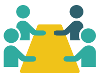
FIGURE 1. HOW DOES ACT WORK?

The teachers participate in a two-day training on student-centred citizenship education at the beginning of the school year.